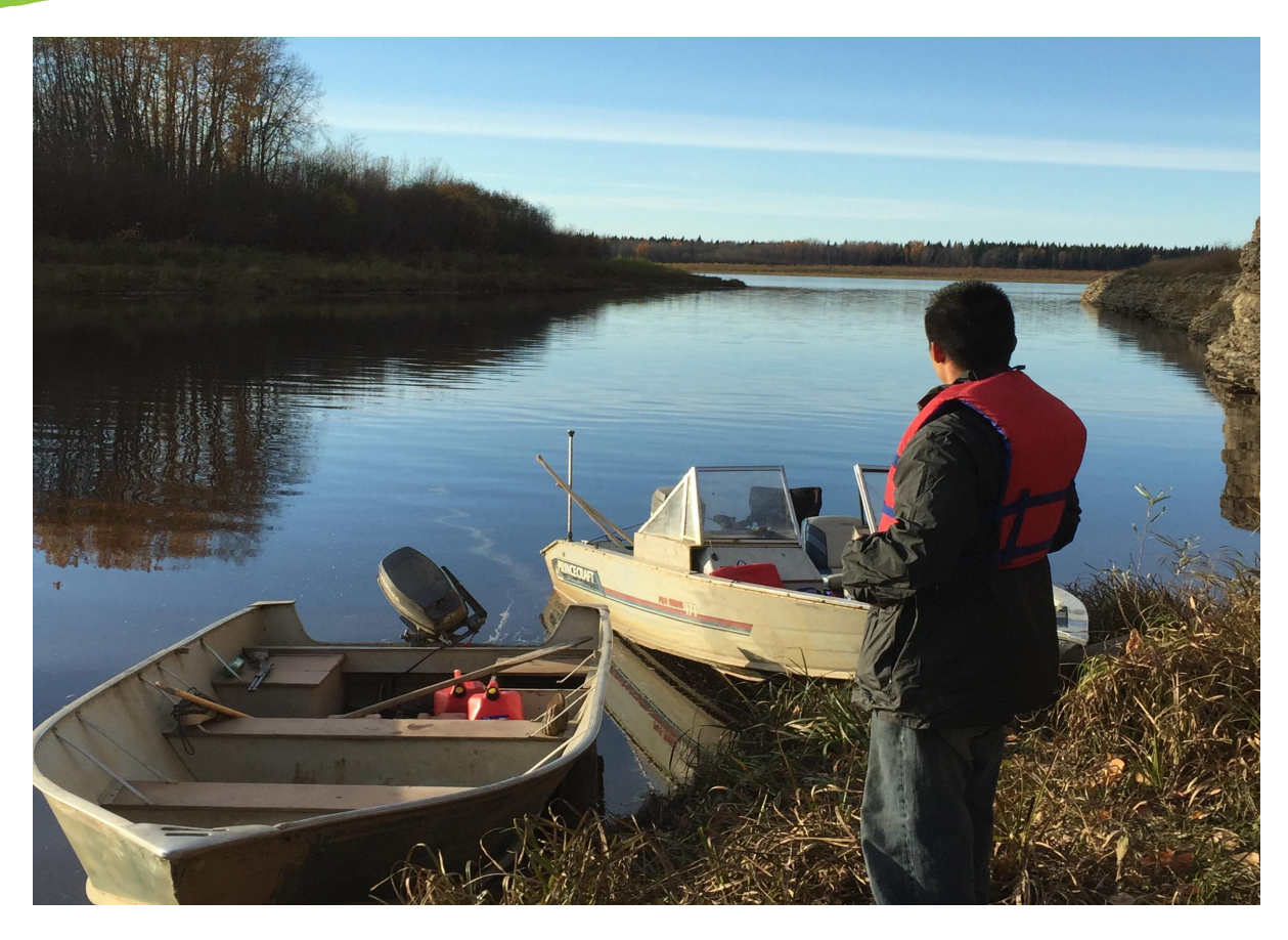
Watching the Peace River (2016) – Photo Credit Brenda Parlee