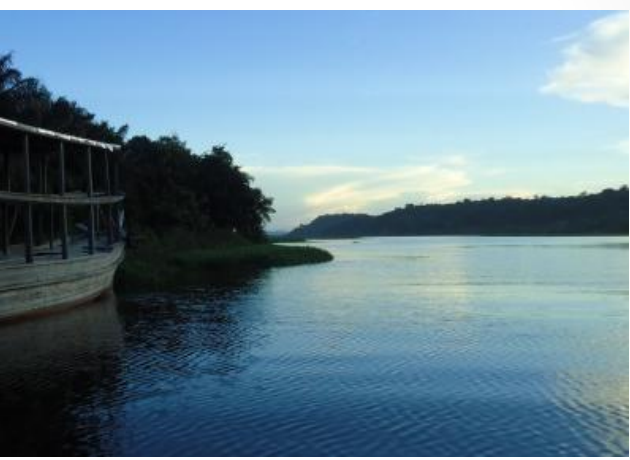
Lower Amazon Basin (Brazil)