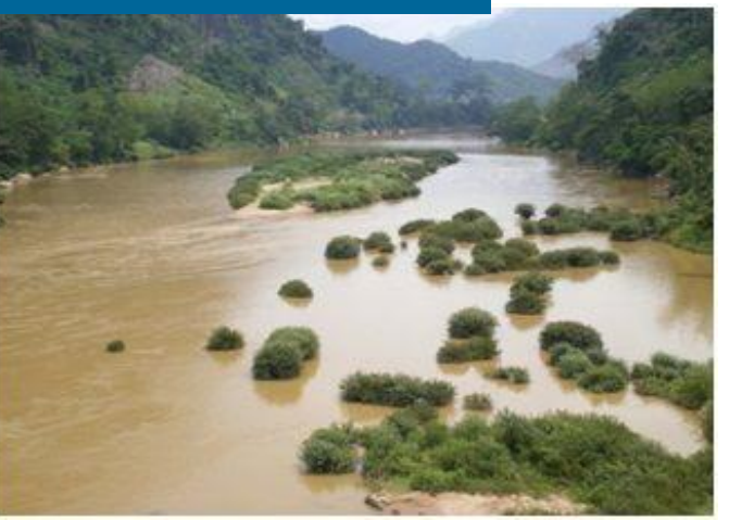
Mekong River Basin (Thailand/Laos)