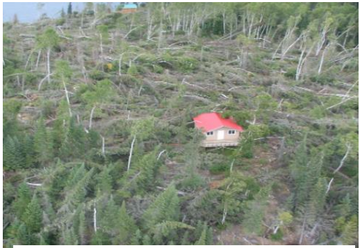
Severe weather blew over trees near Pickle Lake, ON.

More storms bring the possibility of more lightning, a trend some say they are already seeing. Lightning is how most natural wildfires start. Drier conditions on the land also mean that lightning strikes are more likely to ignite wildfires, making the impact of increased lightning strikes even more significant.